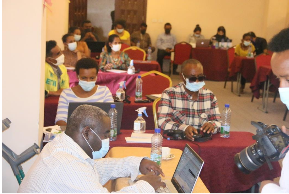
Partial view of participants