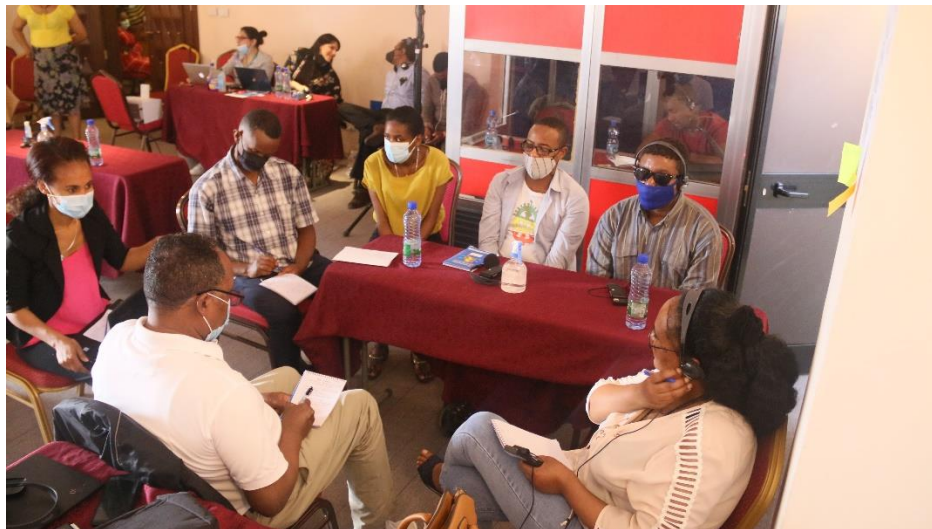
Group exercise: calculating disability costs in social protection programmes